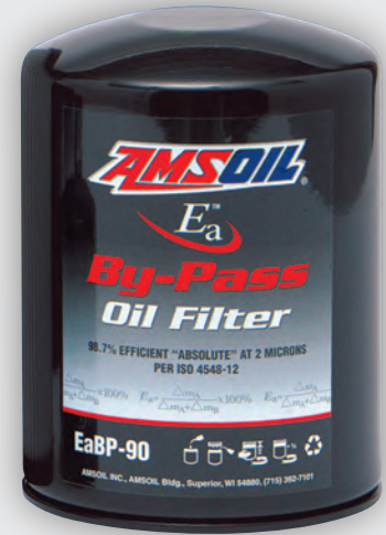
EaBP90 • EaBP100 • EaBP110 • EaBP120

AMSOIL Ea Bypass Oil Filters provide maximum filtration protection against wear and oil contamination. Working in conjunction with the engine's full-flow oil filter, AMSOIL Ea Bypass Filters operate by filtering oil on a "partial-flow" basis. They draw approximately 10 percent of the oil sump's capacity at any one time and trap the extremely small, wear-causing contaminants that full-flow filters can't remove. AMSOIL Ea Bypass Filters typically filter all of the oil in the system several times an hour, so the engine continuously receives analytically clean oil.