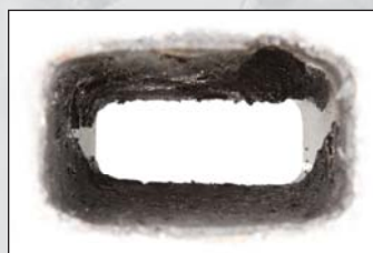
SABER Professional @ 100:1 4% Airflow Loss