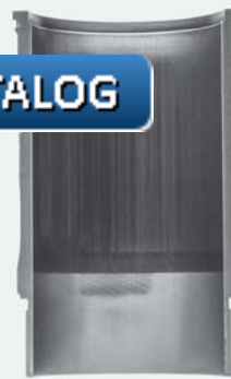
Severely Scuffed Liner