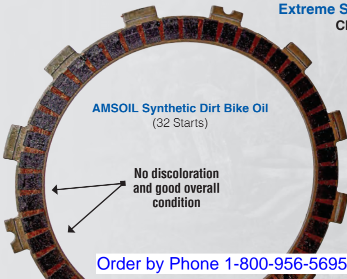
AMSOIL Synthetic Dirt Bike Oil (32 Starts)

No discoloration and good overall condition