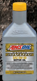
SYNTHETIC MOTOR OIL