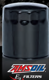
AMSOIL E3 FILTERS