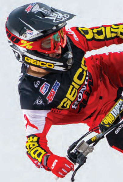
Jeremy Martin GEICO/AMSOIL/Honda