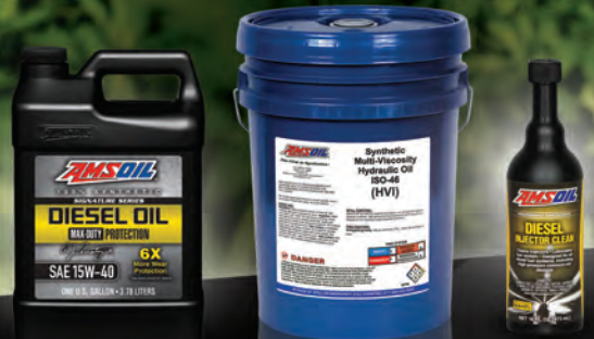
SYNTHETIC DIESEL OIL