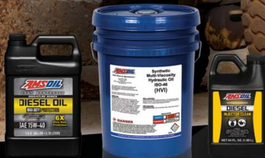
SYNTHETIC DIESEL OIL