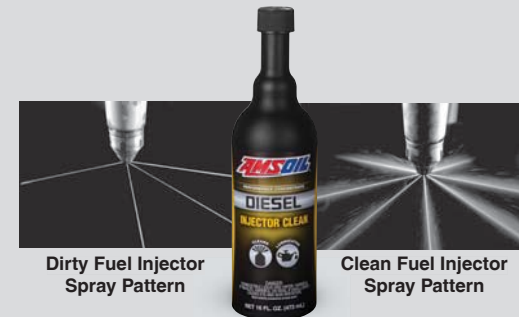
Dirty Fuel Injector Spray Pattern

Diesel Injector Clean also provides added lubricity, helping protect fuel pumps and injectors against premature failure.