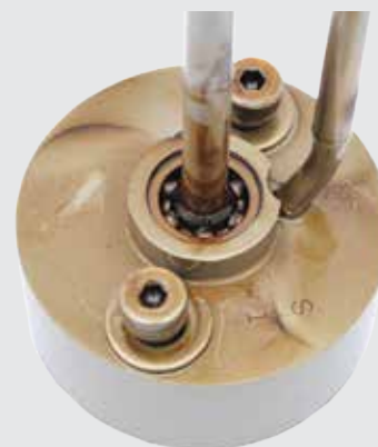
AMSOIL SYNTHETIC MULTI-VISCOSITY HYDRAULIC OIL (ISO 46)