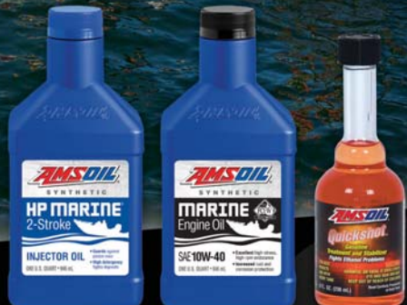
SYNTHETIC 2-STROKE OIL