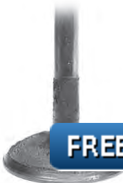
Intake Valve after P.i. Treatment