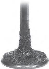
Intake Valve before P.i. Treatment